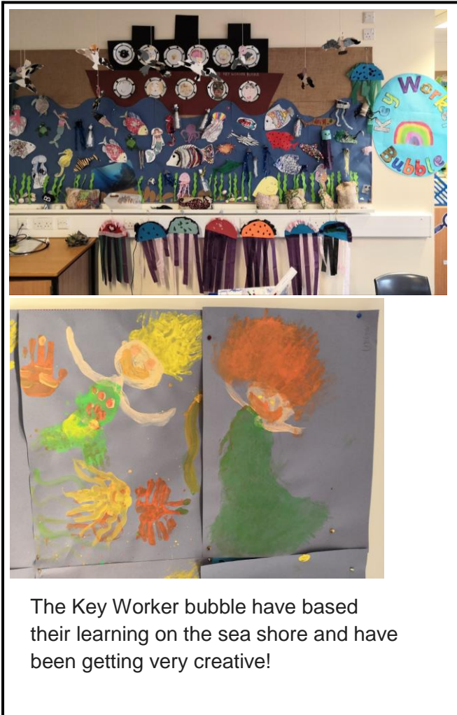
The Key Worker bubble have based their learning on the sea shore and have been getting very creative!