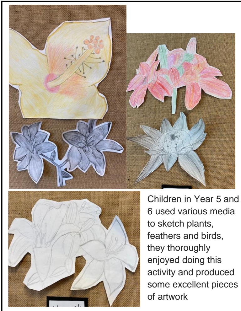
Children in Year 5 and 6 used various media to sketch plants, feathers and birds, they thoroughly enjoyed doing this activity and produced some excellent pieces of artwork