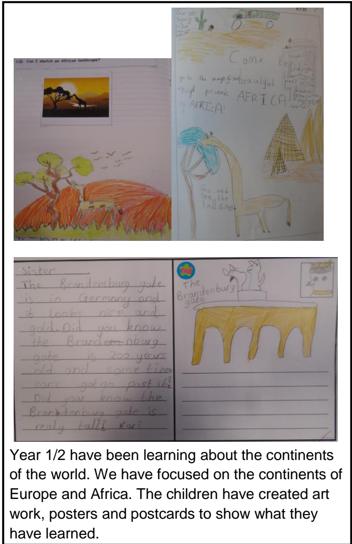
Year 1/2 have been learning about the continents of the world. We have focused on the continents of Europe and Africa. The children have created art work, posters and postcards to show what they have learned.