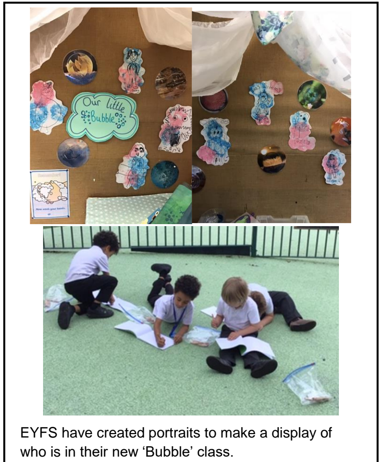
EYFS have created portraits to make a display of who is in their new 'Bubble' class.